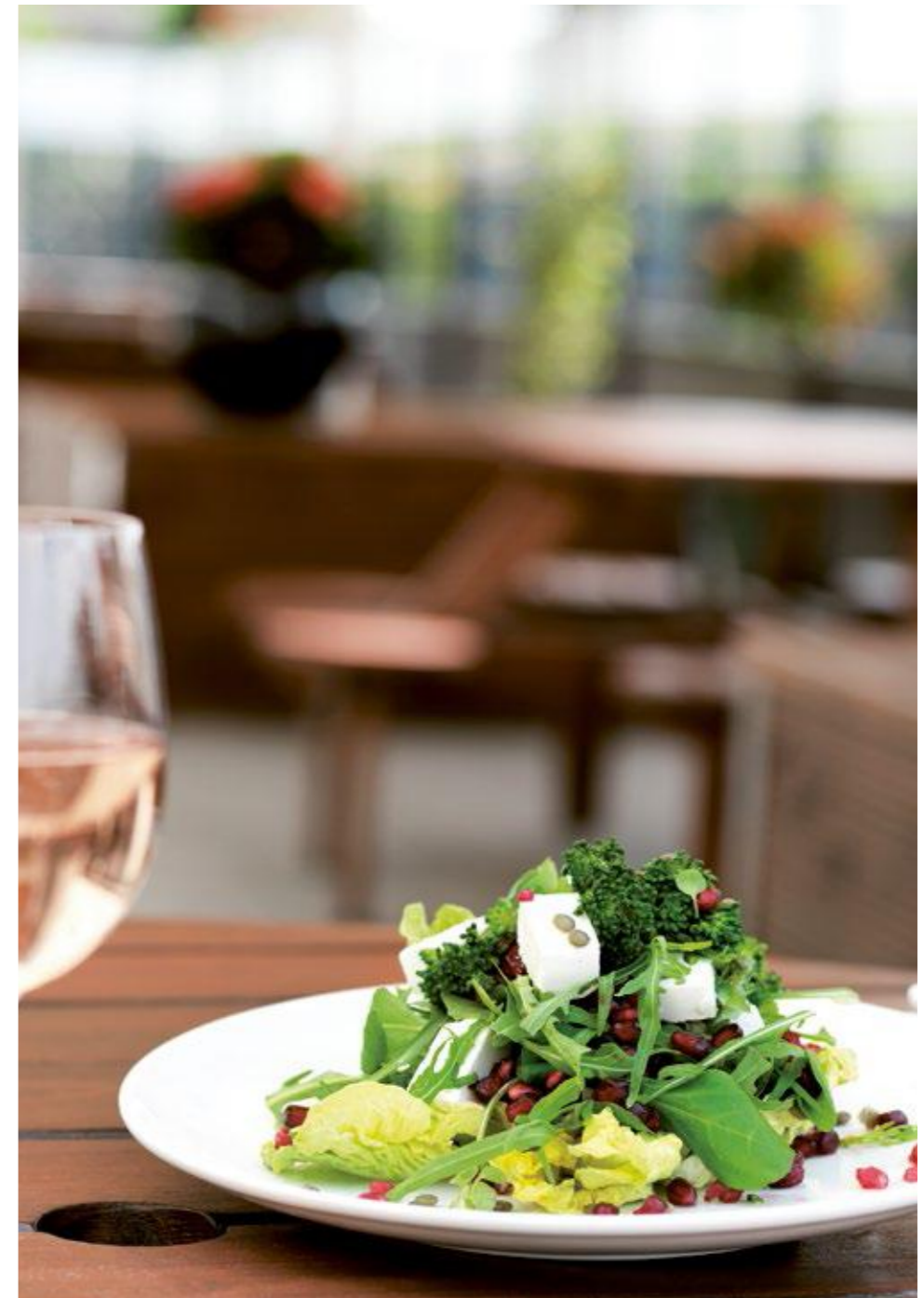
The hotel's charming canal-side terrace may be booked in all weathers for private business or social occasions.